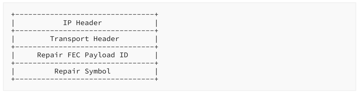
Figure 7: Structure of an FEC Repair Packet with the Repair FEC Payload ID

More precisely, the Repair FEC Payload ID is composed of the following fields where all integer fields are carried in "big-endian" or "network order" format, that is, most significant byte first (Figure 8):