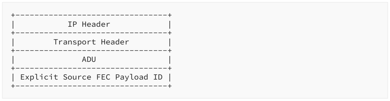
Figure 5: Structure of an FEC Source Packet with the Explicit Source FEC Payload ID

A FEC Source Packet MUST contain an Explicit Source FEC Payload ID that is appended to the end of the packet as illustrated in Figure 5.